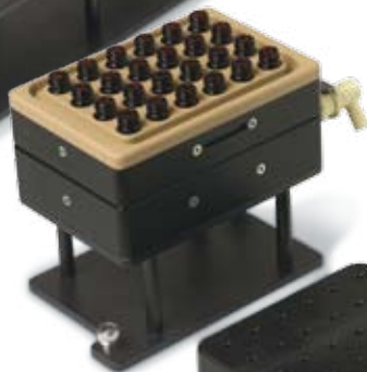
Rack for 24 CYTO-STAT reagent vials with a cover on top of a TEU.