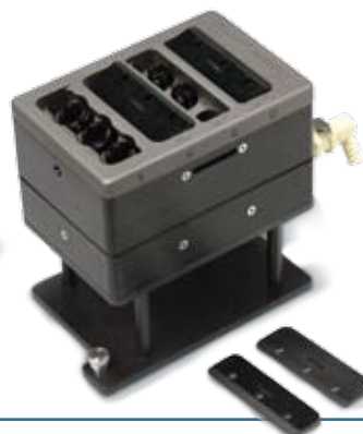
Rack for 12 antibody vials from other vendors with covers on top of a TEU.