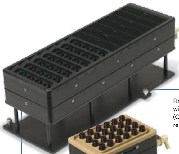
Rack for 56 IOTest reagent vials with covers on top of a TEU. (Covers of the first 7 rows were removed to show the tilted vials.)

The Biomek Antibody Cocktail Preparation Workstation accommodates IOTest and CYTO-STAT reagent vials from Beckman Coulter, as well as antibody vials from other vendors (available upon request).