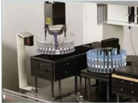
On-deck MCLs with Fly-By Bar Code Reader for cocktails prepared in individual sample tubes