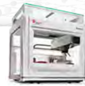
Biomek i5 Automated Genomics Workstation