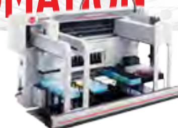
Biomek FX P Automated Genomics Workstation