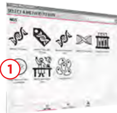
1 Biomek Method Launcher (BML) – secure interface for selecting methods and conducting system maintenance without affecting method integrity.

The Demonstrated Method Interface consists of three parts that make method setup virtually foolproof and error-free.