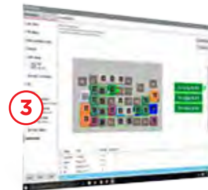
3 Guided Labware Setup (GLS) – Generated per options selected in the MOS, provides the user-specific text and graphical setup instructions with reagents calculation. Eliminates most setup mistakes and makes setup easy work.

To further optimize workflow efficiency, consider these additional software tools: