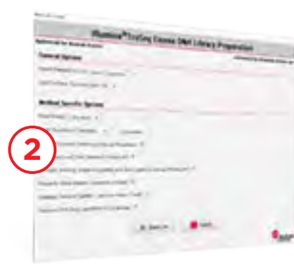
2 Method Options Selector (MOS) – Select runtime options and maximize flexibility in daily scheduling and method execution.