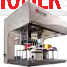
Biomek NX P Automated Genomics Workstation