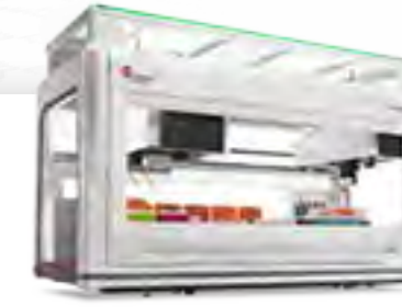
Biomek i7 Automated Genomics Workstation

Learn about the current family of BIOMEK AUTOMATED WORKSTATIONS .