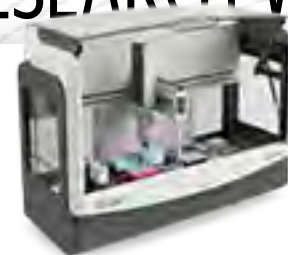
Biomek 4000 Automated Genomics Workstation