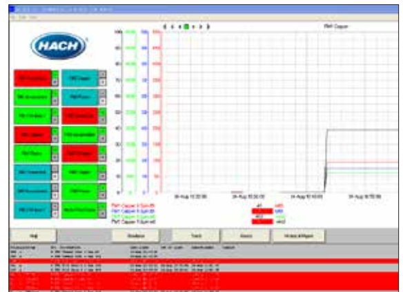
Particle Trends Display

enVigil Lite is ideal for smaller FMS installations consisting of 20 or fewer monitoring locations. The primary advantage of enVigil Lite is that it provides a turnkey software solution without requiring expensive customization.